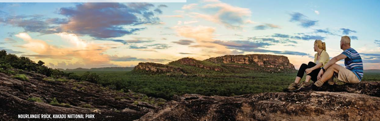
NOURLANGIE ROCK, KAKADU NATIONAL PARK