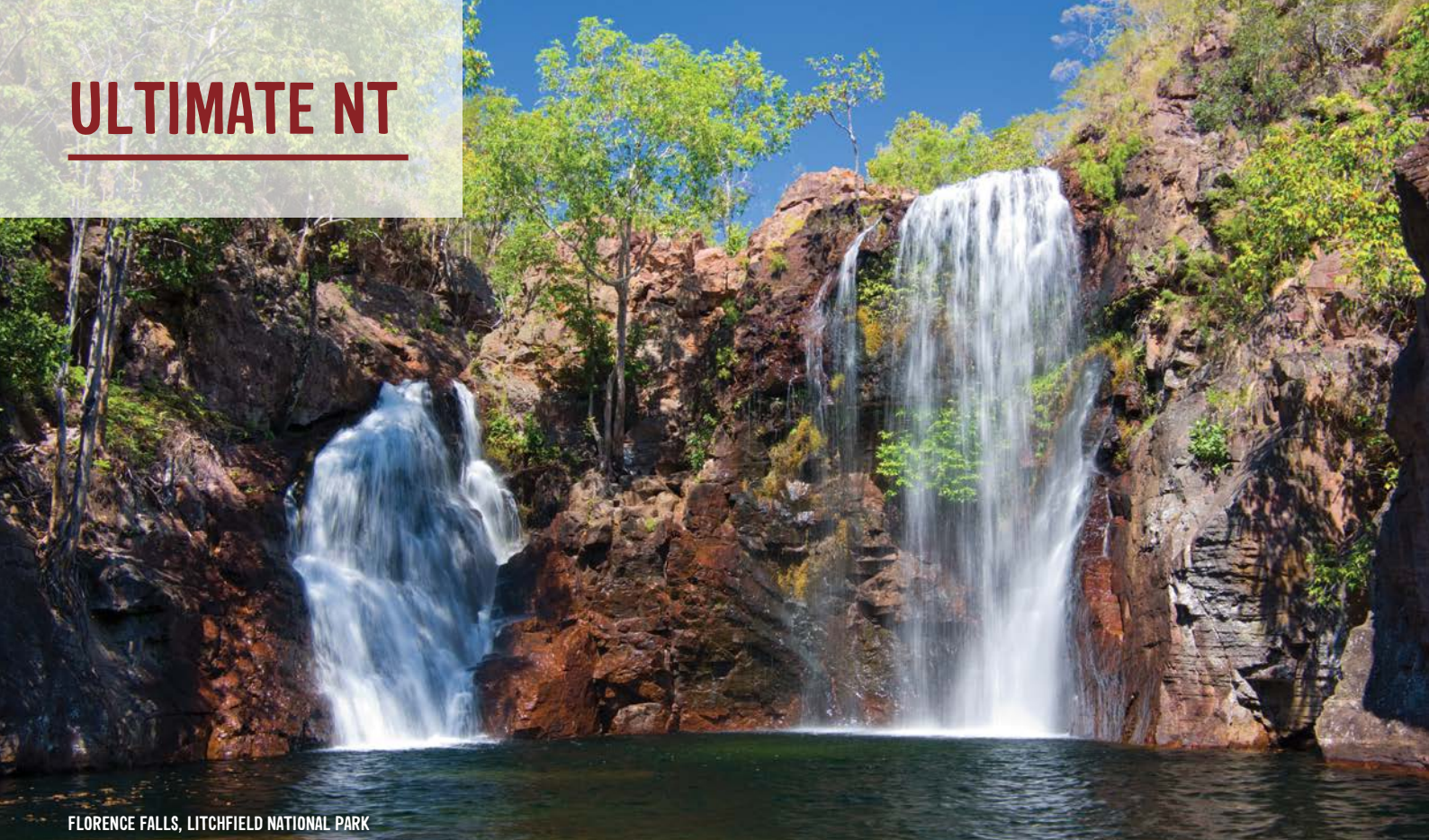
FLORENCE FALLS, LITCHFIELD NATIONAL PARK