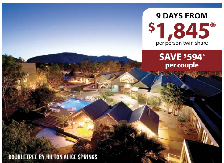
DOUBLETREE BY HILTON ALICE SPRINGS